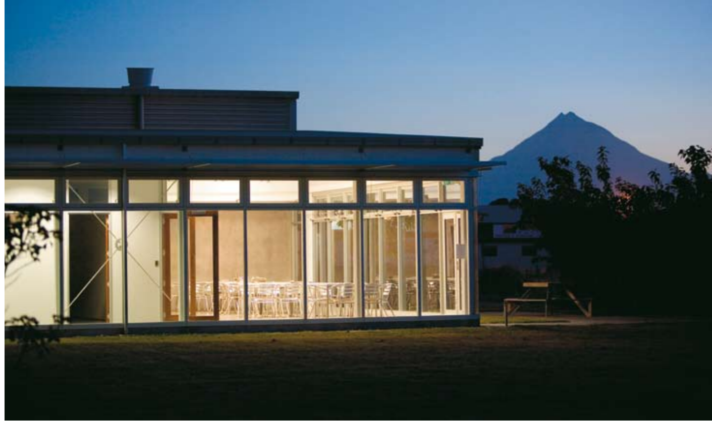
Howard Wright cafeteria within view of Mount Taranaki. Our spacious setting inspires fresh thinking.