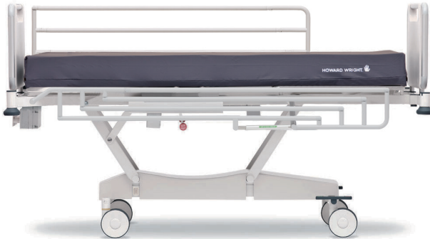
Maximum height (800mm)