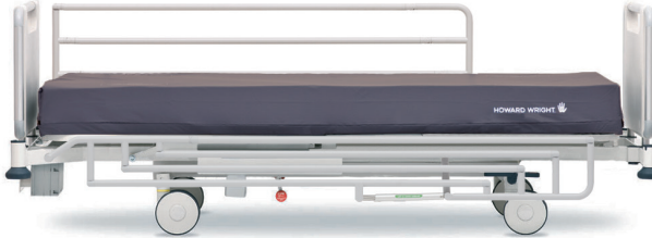
Minimum height (350mm)