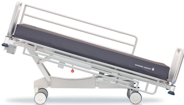
Reverse Trendelenburg (13.5°)