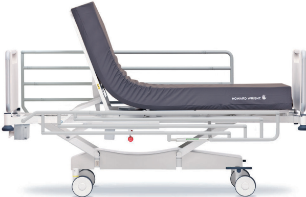
Mid-height (Backrest raised)