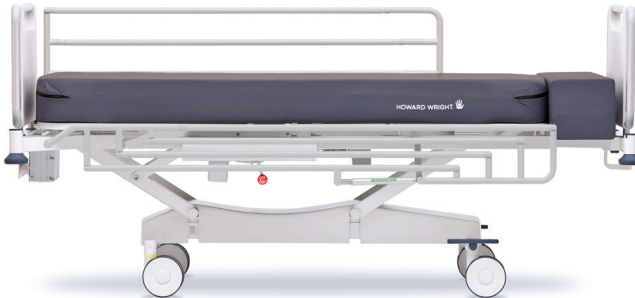
M9 Compact (With bolster)